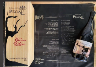
A uniquely crafted wooden case and scarf are included.