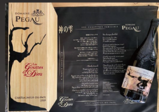
A uniquely crafted wooden case and scarf are included.